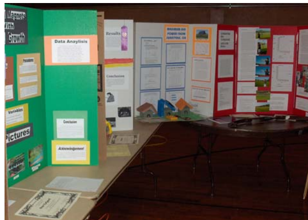
Great projects by all