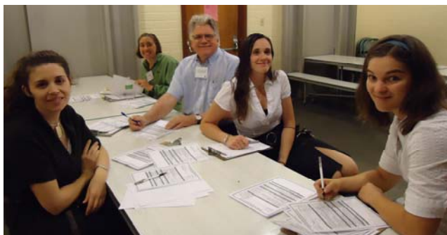
Middle School Science Fair Judges